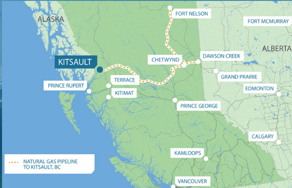
Kitsault Energy Pipeline Route