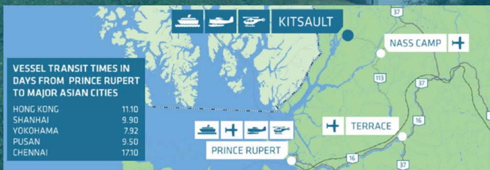
Transit Times From Kitsault Energy Export Port & Terminal